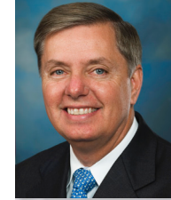
Lindsey Graham United States Senator from South Carolina

Applying for a Nomination to a Service Academy